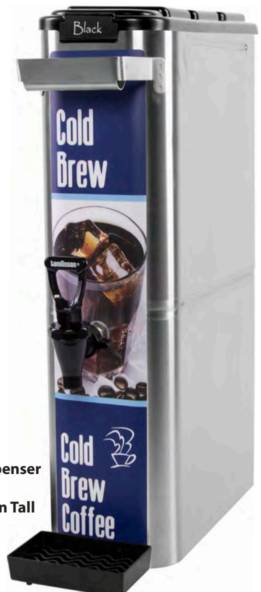
22" H X 6" W X 16.7" D