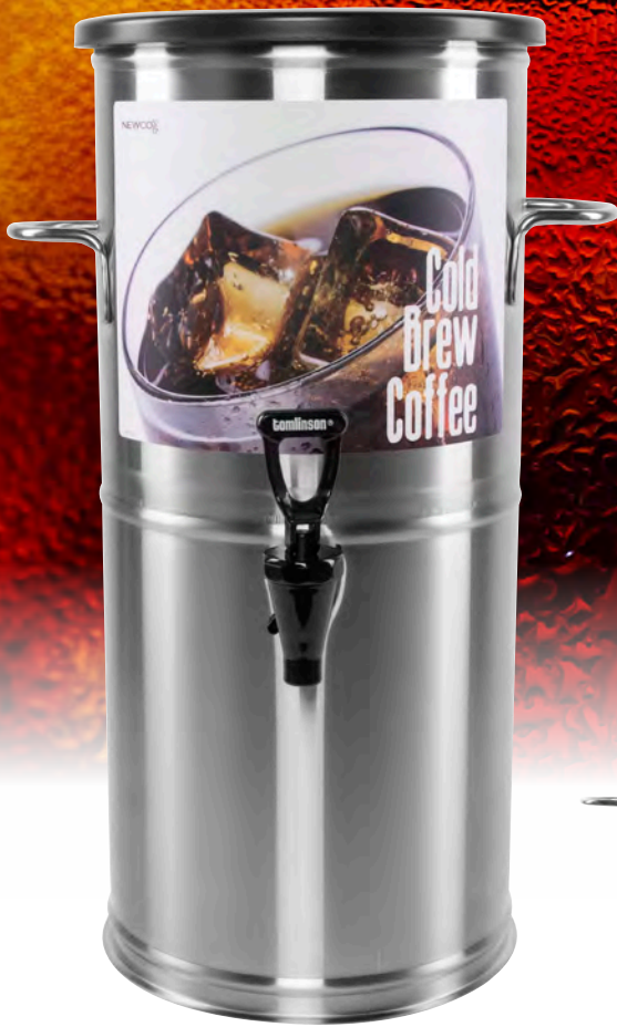
19.5" H X 9.8" Diameter