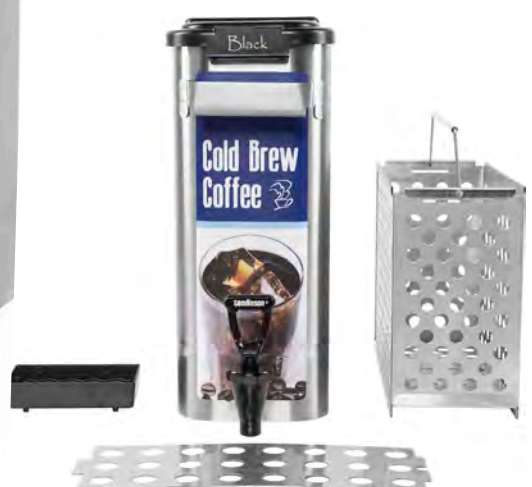
14.4" H X 6" W X 16.7" D